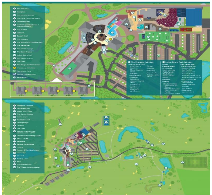
Potters Resorts Five Lakes Resort Map

Sue also plans on contacting local clubs to try and organise games mid-week.